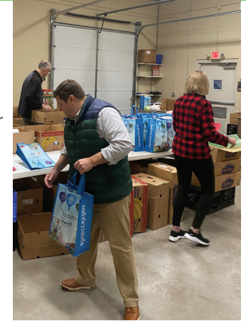
Board members help out in the pantry for their annual Volunteer Day at SAM