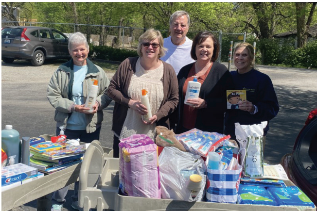
Family Cork at Assumption High School provided SAM with much needed pantry items