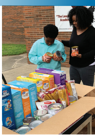
Mill Creek Elementary Food Drive

Shively Area Ministries is an equal opportunity organization.