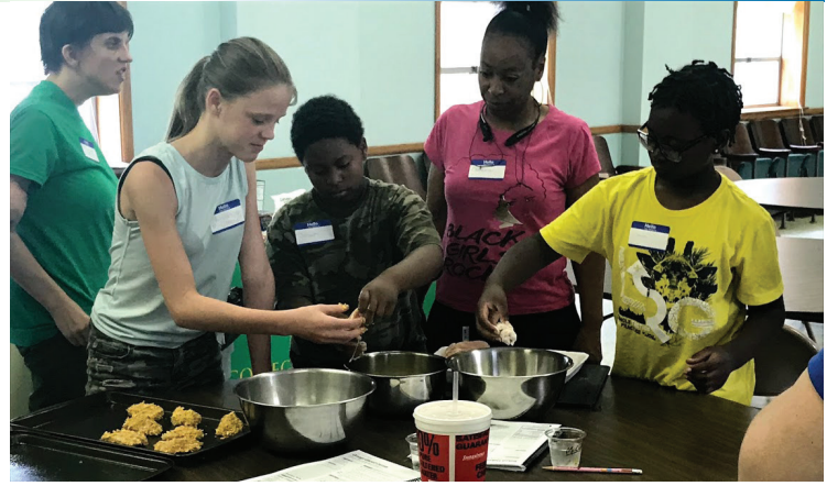
Kids "Cooking Matters" Class

"We had nothing, you are a blessing" – SAM client