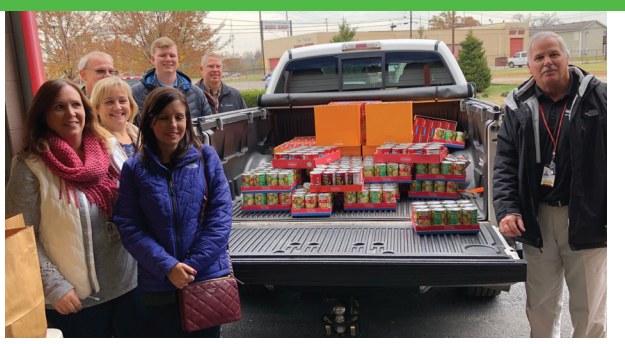
UPS Volunteers Delivering Food Items

"The folks you'll find @ this place are the most amazing passionate caring and kind strangers I've ever had the pleasure of getting to know all through their devotion to be a part of the helping out with the families of the community!" — Google review